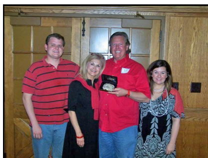
Volunteer of the Year